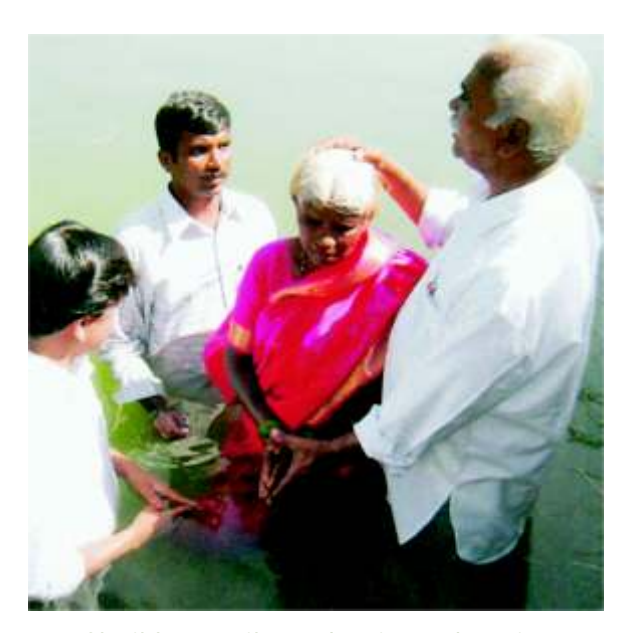
Shaikh Ismail conducting a baptism