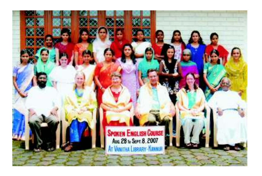
English as a Second Language. Our volunteers called it an unforgettable experience