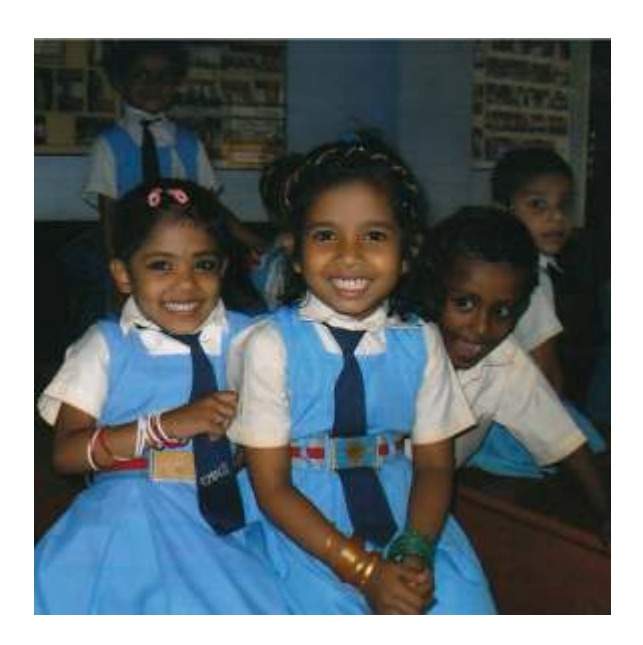
First nursery school at Malappuram