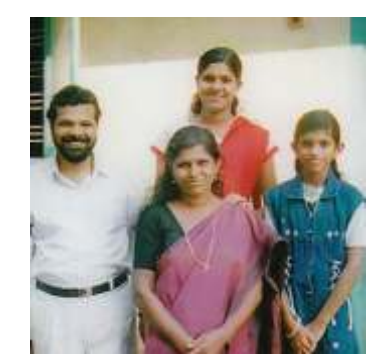
Learning, teaching, sharing and praying