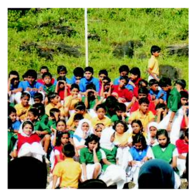
"Let the children come to me"