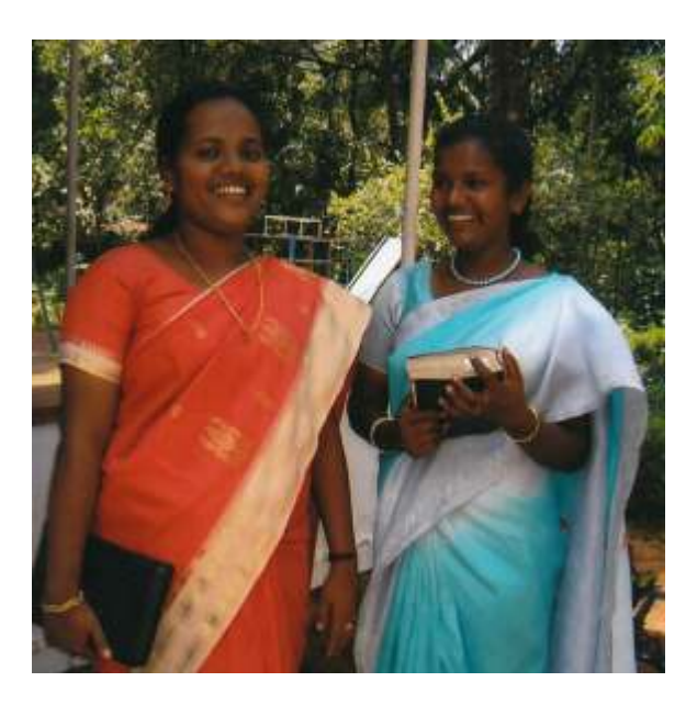
Workers in the vineyard