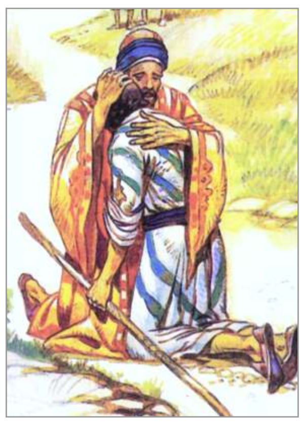
"The message of divine forgiveness"