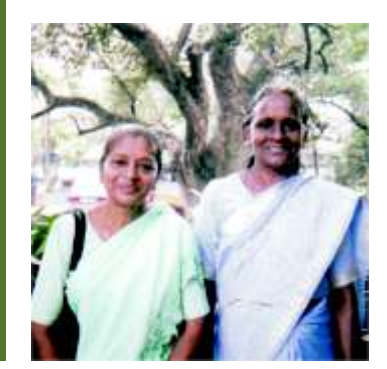
Church planting Born Christian, new believer