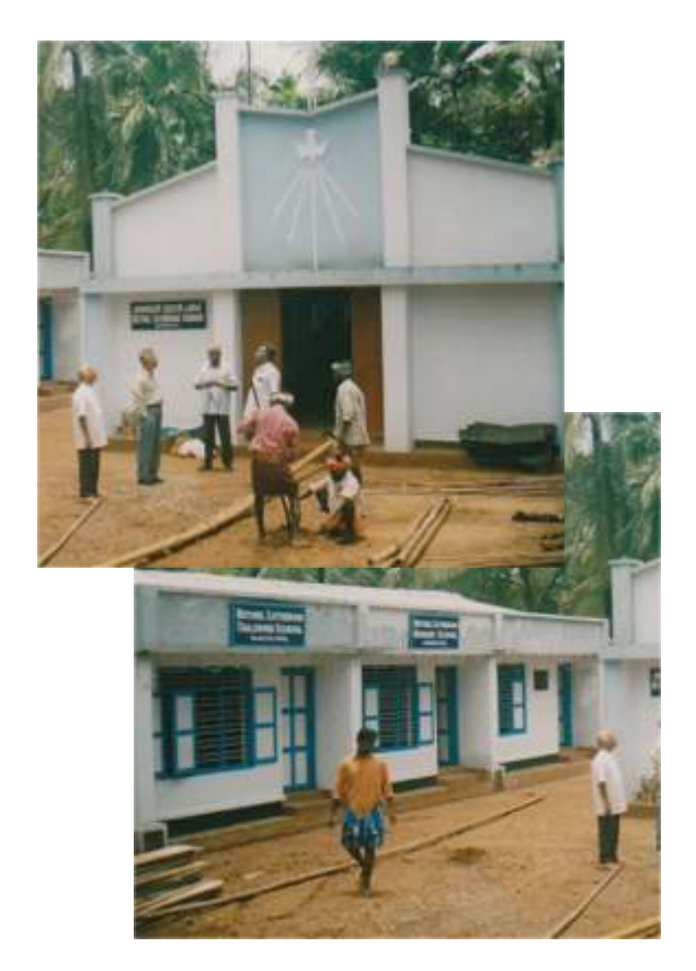
Trinity Lutheran Church, Rochester, MN made this possible