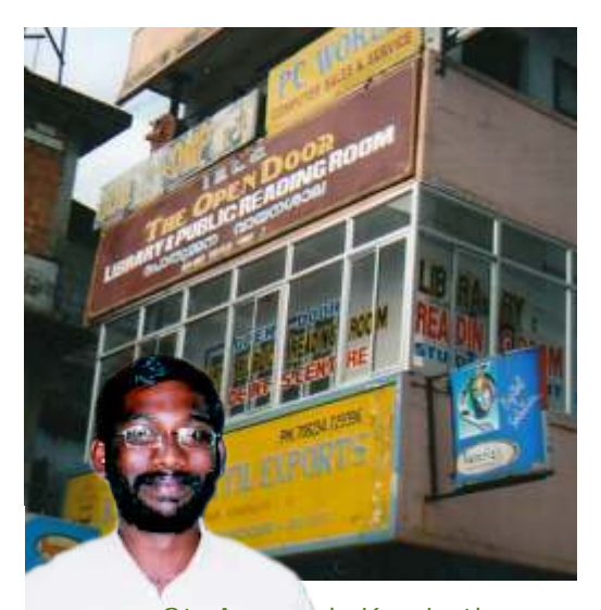
St. Armands Key Lutheran Church, Sarasota, FL made this ministry possible