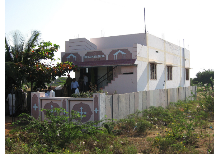
The Gospel for Muslims Ministry headquarters, Begum Manzil , in Uravakonda, a one-hour drive north of Anantapur.

We request all our readers and contributors to pray fervently for all the ministries of the Malabar Mission Society, including the Gospel for Muslim ministry. May God bless our efforts to be good stewards and managers of the blessings with which He entrusts us, so that we may be a blessing to others by using the power of the Holy Spirit through the Word and the Sacraments to bring lost people into the fold of our Good Shepherd. *