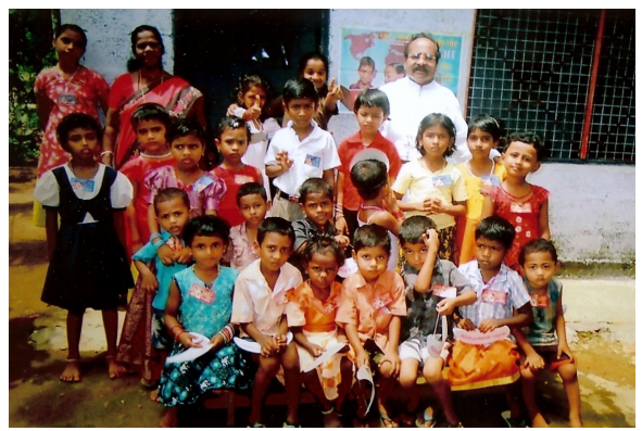
Vacation Bible Schools are verv effective evangelistic tools in India

The congregation in Meenangadi had two "camps:" one with all Christians (95) in