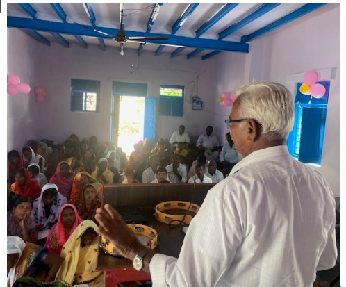
Church Dedication August 9, 2022