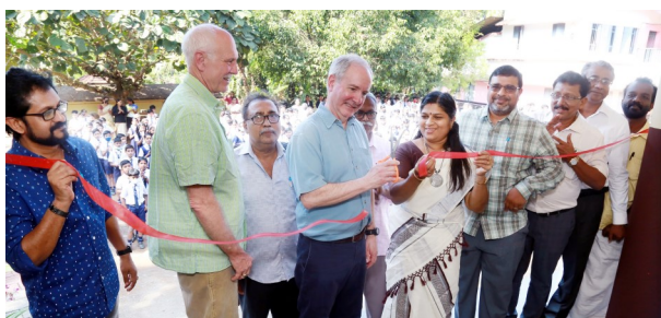
Otten English School Ribbon Cutting