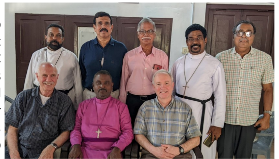
Trivandrum Synod Meeting