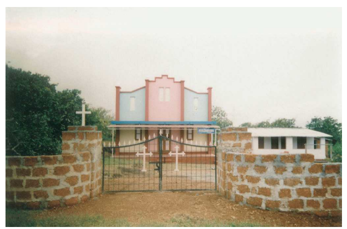
The new Good Shepherd Lutheran Church at Chengalai

urgently needed for these growing mission stations. This might be a good project for a women's society, or perhaps a district or region to undertake.